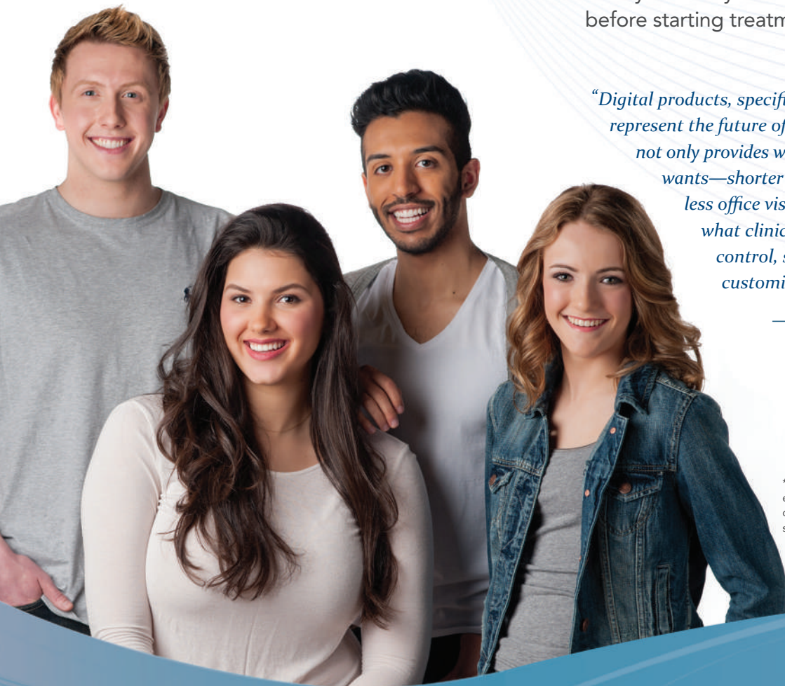
Actual Insignia Patients.

Digital planning and 3D visibility allow your orthodontist to add a level of meticulous detail.