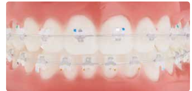
EXPERIENCE ceramic with aesthetic archwires.

In order to make your appliance even more aesthetic, your Orthodontist can propose EXPERIENCE Ceramic. These translucent attachments are close to invisible. The metal part (clip) is whitened to give your entire appliance a «tooth-like» color. In some cases, ceramic attachments are not recommended. Your Orthodontist will tell you.