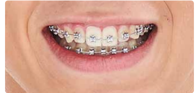
Rh EXPERIENCE metal Rhodium

Depending on the treatment offered, you can choose between a traditional metal bracket, or a more discreet Rhodium Coated metal bracket. Rhodium Coated brackets are highly aesthetic due to their low reflective matte finish. Your Orthodontist will advise you according to your defined treatment plan.