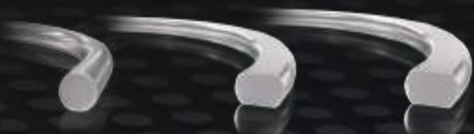
Round Wires .014, .013 CuNiTi