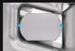
DAMON ULTIMA Round-Sided Rectangular Wire .018 x .0275 CuNiTi