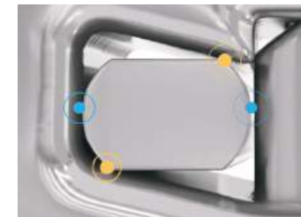
DAMON ULTIMA SYSTEM

Excessive play resulting in poor control